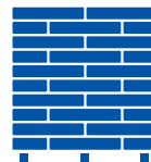
40 x 25 KG BAGS