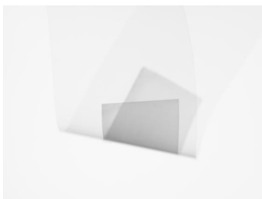
OrelTech silver transparent electrode on PET

* - 95% or more of the material remain on the PET after the test