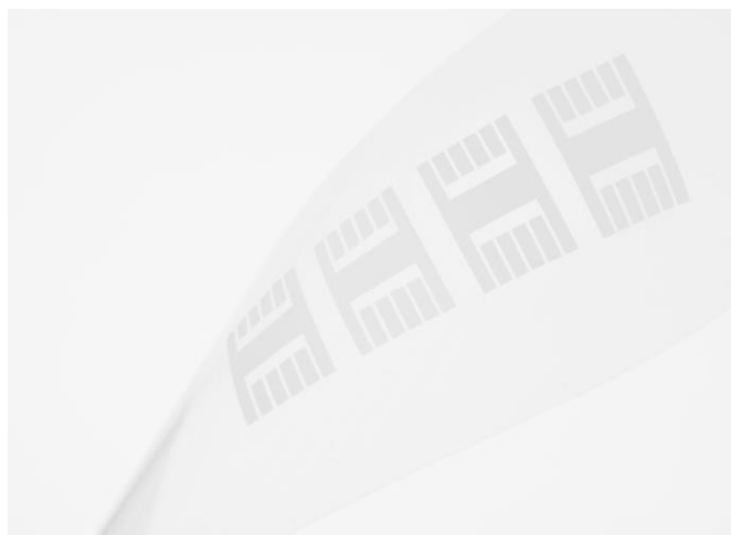
OrelTech silver transparent electrode on PET